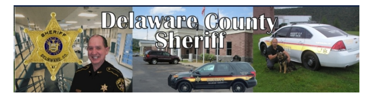
SHERIFF'S WEBSITE http://www.co.delaware.ny.us/departments/shrf/shrf.htm

The Sheriff's Office has hosted an increasing number of tours through the jail to provide visitors with a first-hand look at how we supervise the inmate population. The tour takes visitors through the process, from the inmate booking area through to viewing housing units where they gain first-hand insight into how inmates spend their time. It is interesting to see the variety of reactions. Some people vow never to be on the wrong side of the bars and some people indicate they could never be on the right side of the bars because they could not tolerate being boxed in for the duration of their workday. Their reactions are a constant reminder that we are lucky that we have dedicated employees who are willing to endure what others might view as inconveniences that come with the job. It takes a very focused and detail-oriented person to satisfactorily perform the duties of a correction officer. Ultimately, most people leave the tour having gained a better appreciation of their freedom, after having glimpsed how incarceration can deteriorate one's lifestyle.