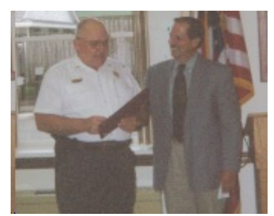
Newman honored as Employee of Month 2000

(Born: November 19, 1939 - Died: September 15, 2015)