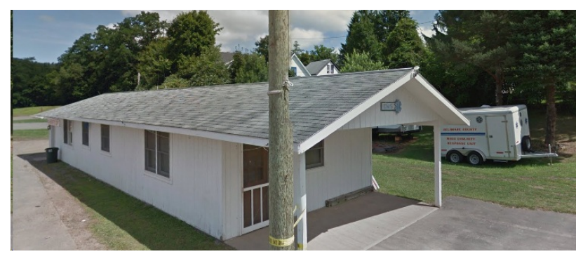
Security Command Center at Walton Fairgrounds

The Delaware County Sheriff's Office is proud to be the lead security agency at the annual Delaware County Fair in Walton, held next on August 15-20, 2016.